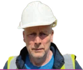
STEVE SEVIER BASEMENTS & STRUCTURAL WATERPROOFING